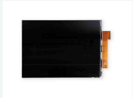
Figure 2. 100088646 13.3 Elnk Spectra 6 Color Display