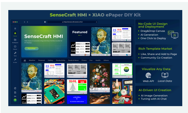
Figure 1. MTY4ODg1NzExOTcwMjg1OQ 102678 4ECbDCMBDxTQJ0cN 1770169267