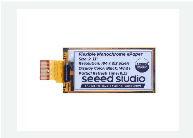
2.13" Quaduple Color ePaper Display