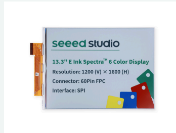
Figure 1. 100088646 13.3 Elnk Spectra 6 Color Display

The 13.3 inch spectra™ 6 e Paper Display offer a high-quality, low-power solution for a wide range of applications. The model features a 1200 x 1600 resolution, black, white, yellow, red, green and blue display with a diagonal size of 13.3 inches. With a fast refresh rate and excellent contrast, this display is ideal for e-readers, smart wearables, and other portable devices.