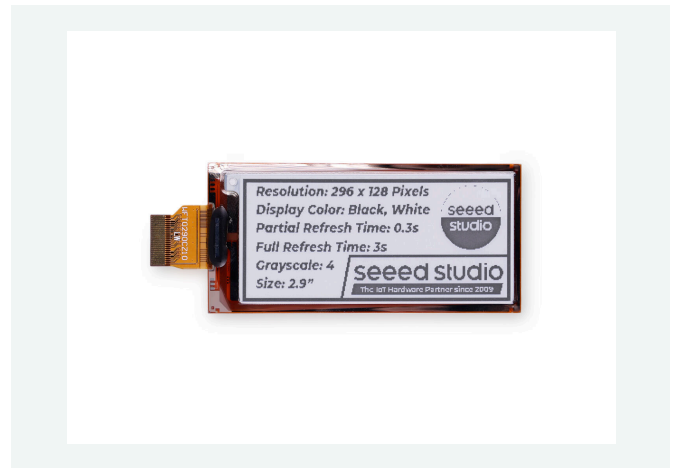
2.13" Flexible Monochrome ePaper Display