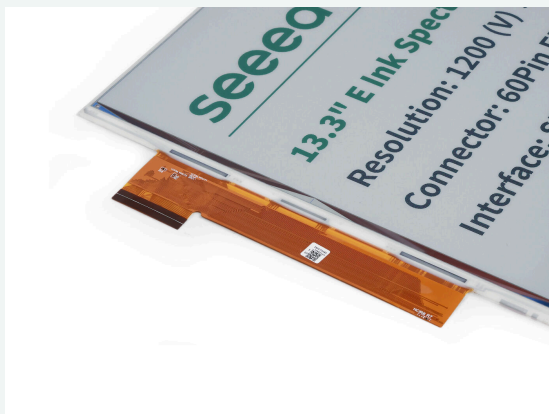
Figure 3. 100088646 13.3 Elnk Spectra 6 Color Display