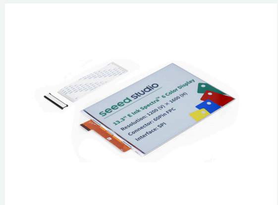
Figure 4. 100088646 13.3 Elnk Spectra 6 Color Display 2