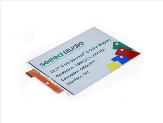
Figure 1. 100088646 13.3 Elnk Spectra 6 Color Display